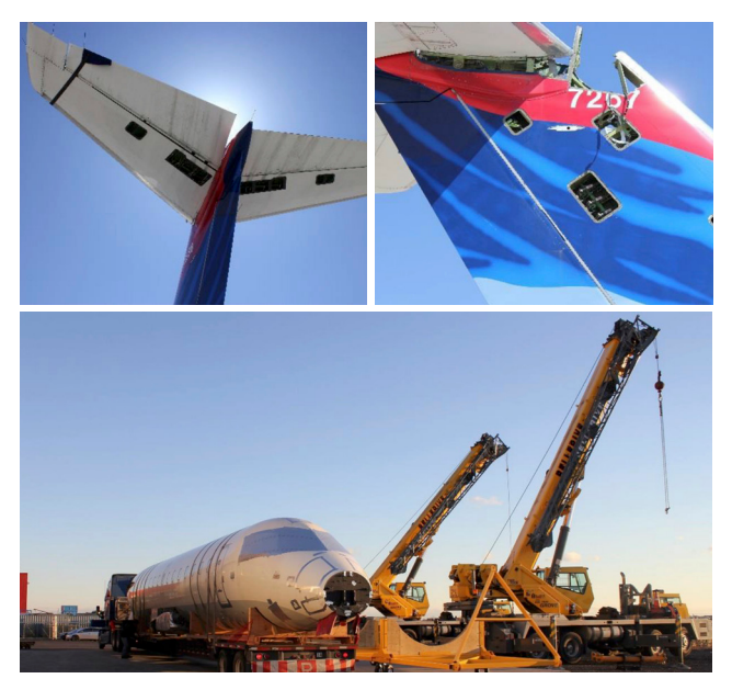
Figure 3. Bombardier CRJ100 tear down

Funded through the Consortium for Research and Innovation in Aerospace in Québec (CRIAQ), Canada, this project started in October 2011 and was completed in December 2015, with these outcomes: