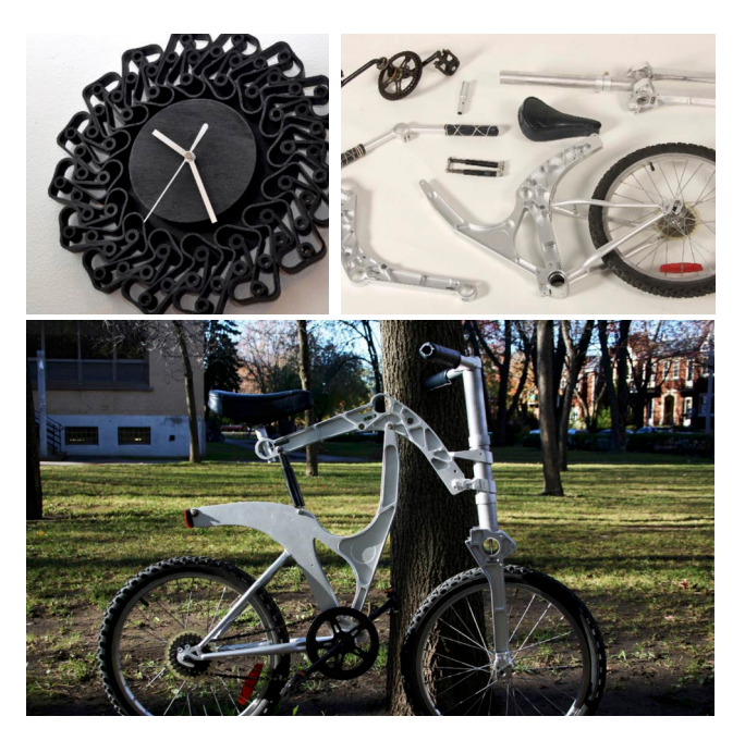
Figure 4. Re-designed leftover aircraft material

The consortium also has worked with Industrial Design students at the Université de Montréal to re-design leftover aircraft material into potentially commercially viable items such as bicycles, clothes, etc. Known as up-cycling, it aims to identify / demonstrate solutions to discarding non-recyclable material into landfill.