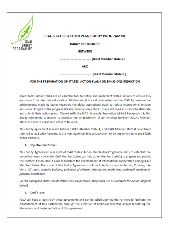
Figure 2. ICAO Buddy Programme agreement