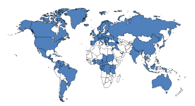
Figure 1. 94 States have submitted an action plan (June 2016)

This first of its kind partnership on environment and aviation demonstrates that the impact of the States' Action Plans goes far