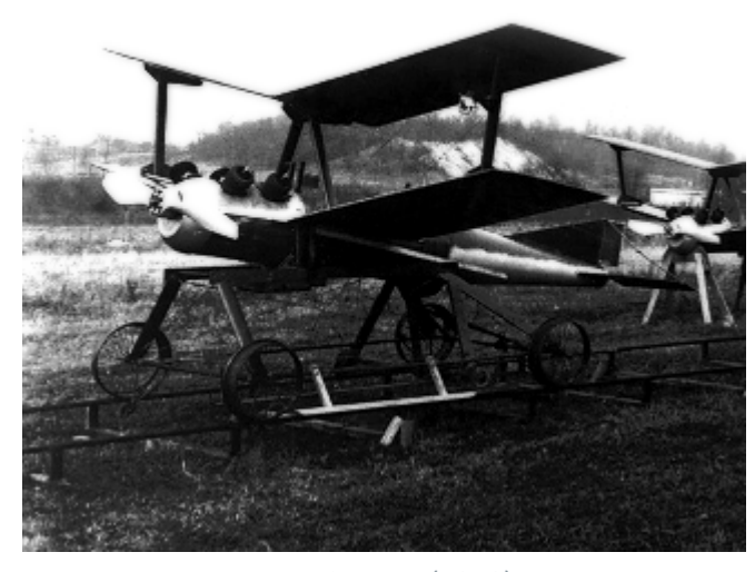
Kettering Bug (1918)