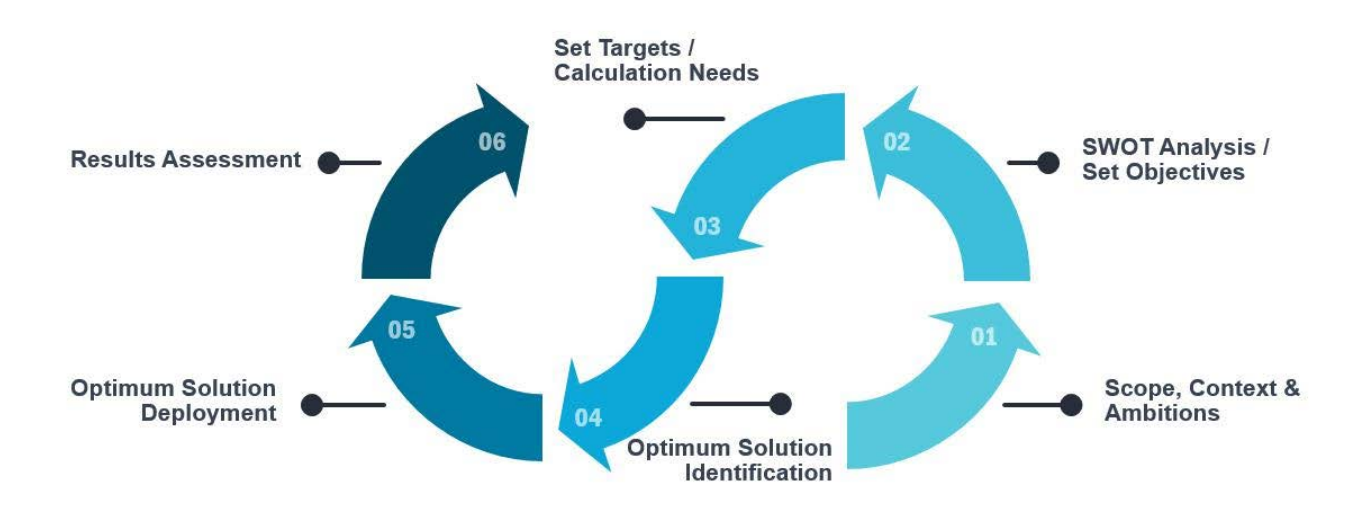
Figure 1 Six-step performance management process

1.5 Although there are several ways to apply a PBA, ICAO advocates for a globally harmonized performance management process based on six well-defined steps. The goal of this cyclic six-step method is to identify optimum solutions based on operational requirements and performance needs so that the expectations of the aviation community can be met by enhancing the performance of the air navigation system and optimizing allocation and use of the available resources.